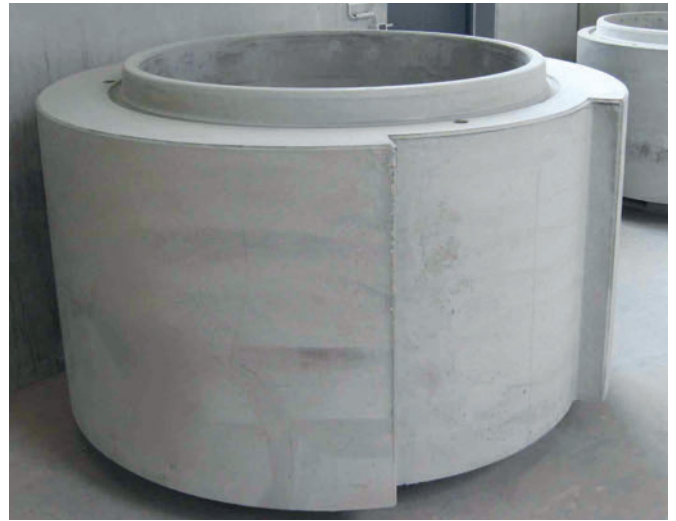
Mould components to optimize product weight and design

demoulding of the products. In the space of just two years, this concept was refined and perfected so that up to 100 different - that is to say, individual - manhole bases could be produced in a single working shift. The suitability of the moulds for automated processes was one of the cornerstones in the strategy for reconciling industrial manufacturing with batch sizes of one.