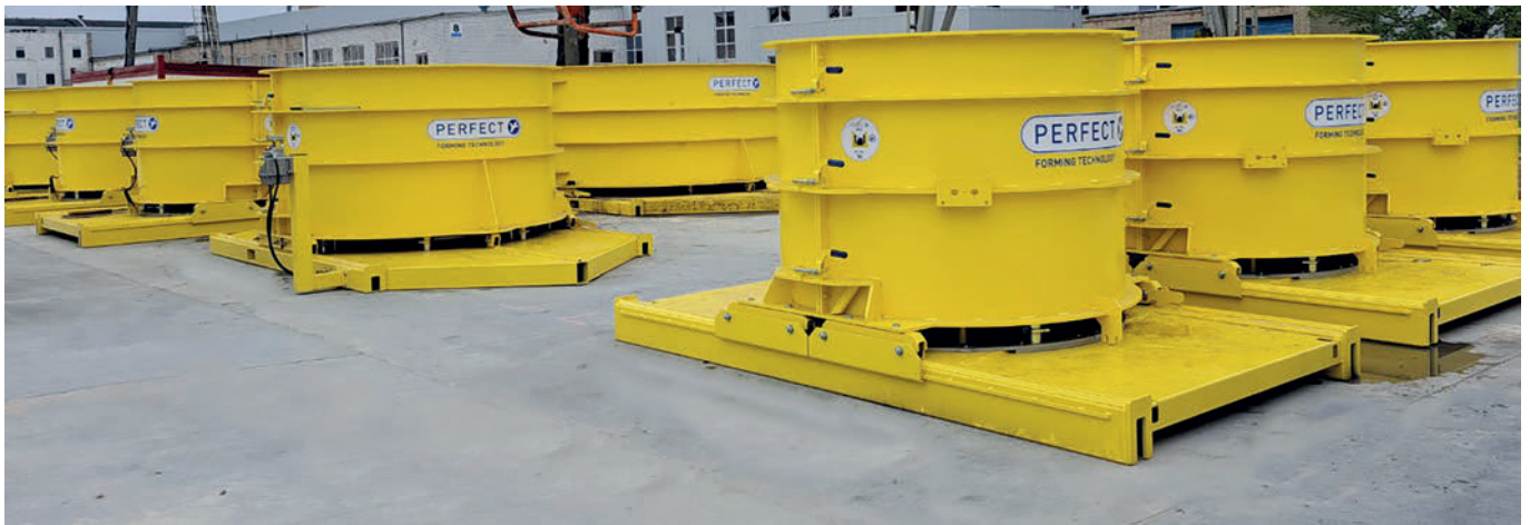
The Perfect Forming Technology concept used here for components up to an internal diameter of 3000 mm