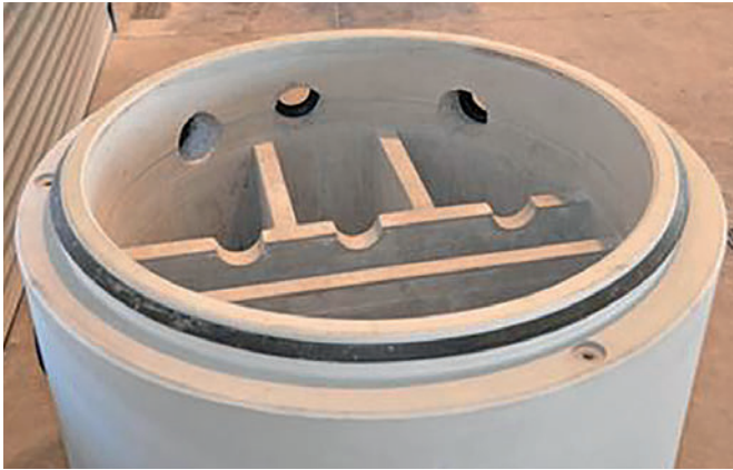
Component variability on the basis of functional casting moulds