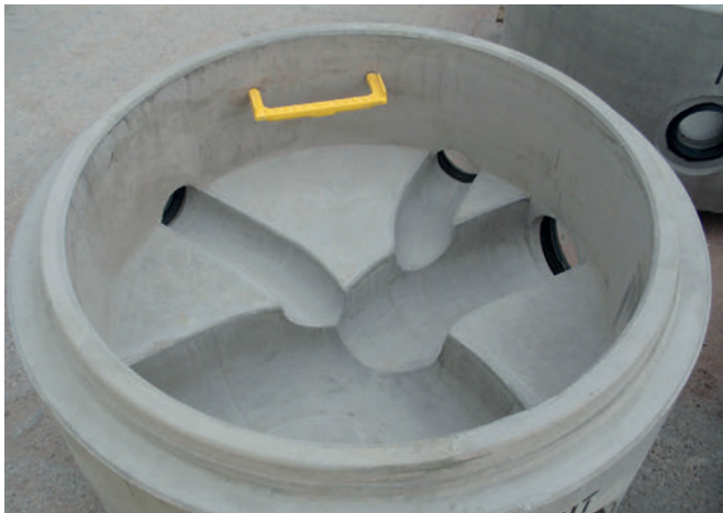
Different installed parts (gaskets, step rungs, etc.) and individual channels

...ciple was often driven by aesthetic demands that changed with the times. Bringing things back to the world of concrete, this maxim has been applied to the design of highly durable components. While the end product may feature numerous