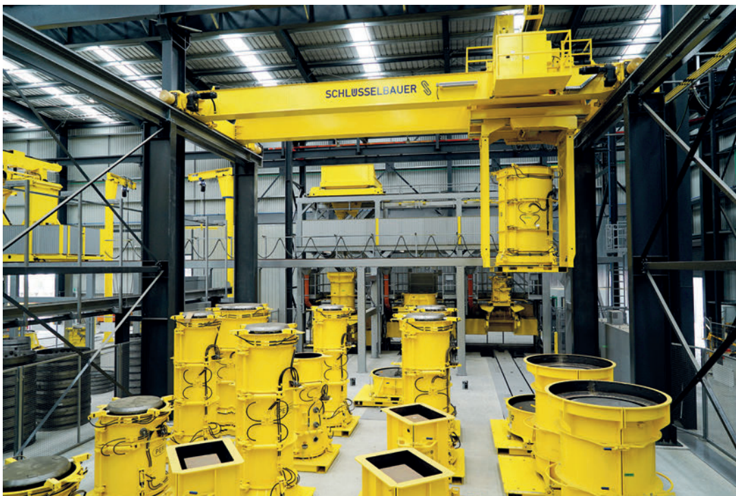
A wide variety of moulds for cost-effective mass production of wet cast components

pipes, infrastructure manholes, and much more. All of these applications involve the use of casting moulds, which have gained global recognition under the collective name "Perfect Forming Technology". The fundamental requirement for the moulds that bear this name is expressed succinctly by the slogan "Functionality needs the perfect mould." Ultimately, it is the functionality of the concrete components – that is to say, their durability under constantly changing conditions – that dictates whether a mould has actually served its purpose. By as early as the late 19th century, "Form follows function" was already becoming an increasingly recognized principle of building construction, and it would go on to form the backbone of many areas of architecture and consumer goods design in the 20th century. The discussion of this design prin-