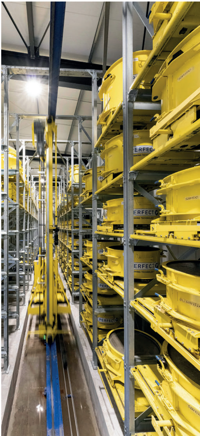
High-bay racks as efficient, space-saving curing areas for mould-hardened products

it. Advancements in mould construction have made it possible to influence product quality in areas that may be of lesser importance to decision-makers at the time of installation. In some cases, we can even take that design principle of “Form follows function” and neatly turn it on its head: “Improved functionality follows perfectly formed moulds.” For each and every project, whether it involves a single mould or hundreds of them in automated mass production, the engineers at Schlüsselbauer Technology are dedicated to maximizing the benefits of the end product and the mould technology.