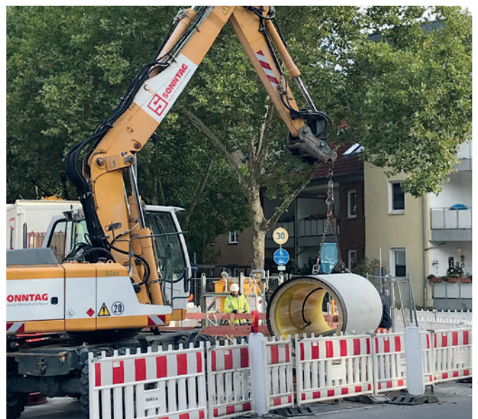
Datteln project: Lifting into the starting pit, piping detail with bentonite lubrication.