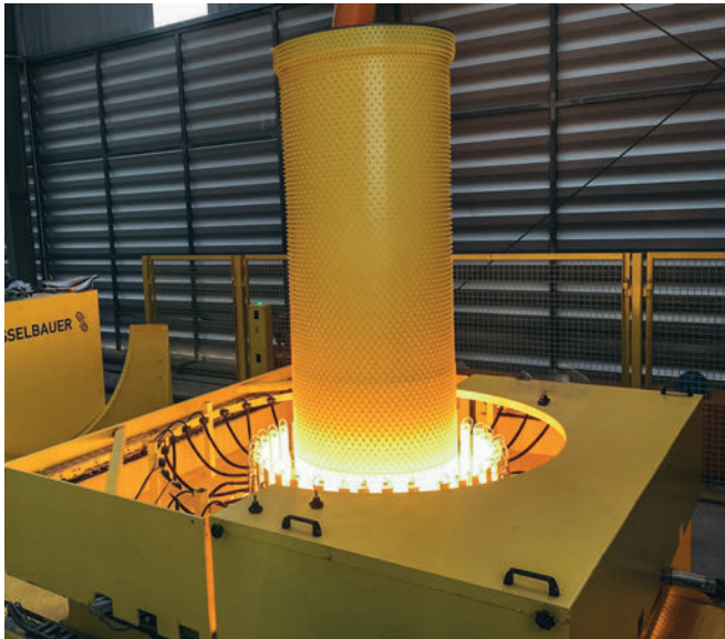
Thermoplastic forming of the liner to the inner joint