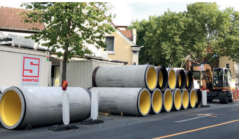
Datteln project, North Rhine-Westphalia, Germany: Site warehouse for DN 1200 Perfect jacking pipes from Beton Müller.

Whenever one of the conditions in a pipeline project is to provide protection against chemical attack, questions always arise concerning feasibility and durability with regard to long-term use. This starts with the choice of material, includes the installation conditions, and ultimately means that pipe producers need to meet special requirements. The polyethylene liner material processed by Beton Müller on an industrial scale provides the basis for the tightness of the pipe liners. The welding and forming processes are subject to ongoing