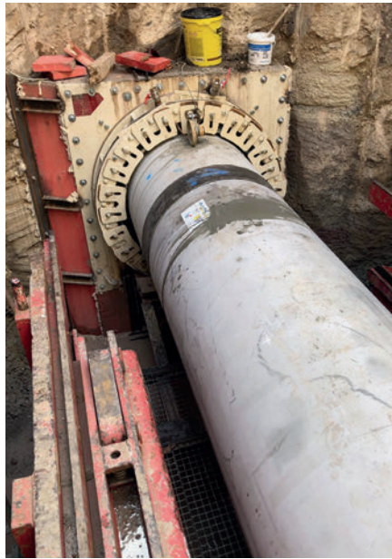
DN700 project, Medernach, Luxembourg: Starting pit

checks by internal and external monitoring teams, and ensure that there is corrosion protection in the pipe from the spigot to the joint. The connectors perfectly complement the hybrid pipe. They are mounted in the pipe in the starting pit before the next pipe is positioned. They provide a flexible but tight connection in the pipe joint both during and after insertion, such as in the event that the pipeline is repositioned in the substrate. Two external gaskets on the connector ensure that there is always corrosion protection, even in the joint.