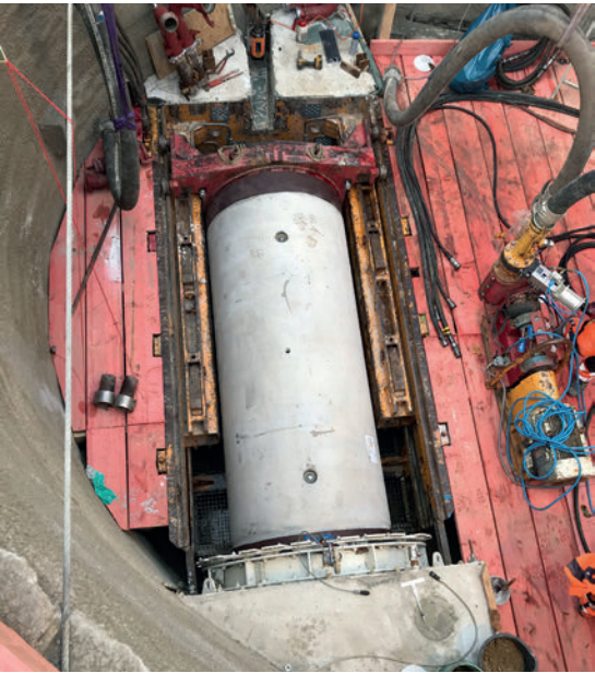
Datteln project: The next pipe is pre-pressed, while the joint is already mounted by means of plug-in connection (connector).