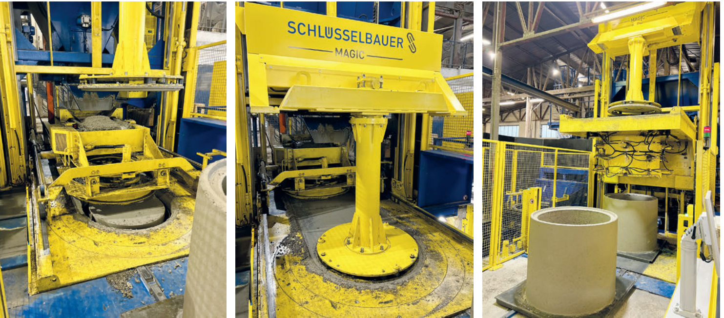
Production of a manhole riser with the Magic 1501

The Magic 1501 is a production system for manhole components such as risers and eccentric cones with heights of up to 1,500 mm, as well as for various civil engineering elements in large quantities. The machine allows single or multiple production of up to six precast parts and is designed for maximum product sizes of up to 1,800 mm outer diameter in single production. Kühne uses the Magic 1501 to produce manhole risers and manhole cones.