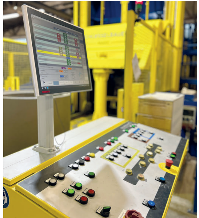
Convenient operation at the control panel

Kühne opted for the Magic 1501 as a standalone machine. Owing to the limited space available, the other concept would not have been feasible. The production halls are fully occupied and there is no possibility of further expanding the production area at the current site.