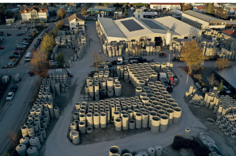
The site of the Kühne concrete plant in Geretsried, near Munich

Schlüsselbauer Technology GmbH & Co. KG Hörbach 4, 4673 Gaspoltshofen, Austria T +43 7735 71440 sbm@sbm.at www.sbm.at