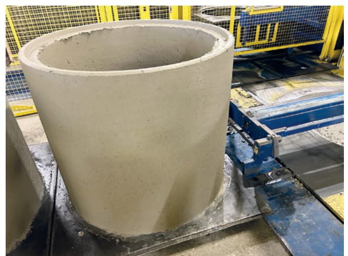
The fresh product is lifted out of the machine on the bottom pallet

until they reach the pickup position. Another employee then uses the electrical transporter to move the products from the production system's buffer zone to the indoor storage area for hardening. The electrical transporter is designed so that it can always accommodate two bottom pallets with products for highly efficient transport. Before being transported away, the fresh concrete manhole elements undergo another visual inspection and are fitted with a set ring that remains on the manhole element during the early hardening phase. At Kühne, the entire production process for manhole parts is handled by three employees, even if two would suffice at this level of automation. The result is a less stressful working environment, and this also means that production can continue even if one employee is unavailable, as there is always more than one person assigned to the system.