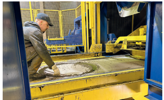
Inserting the reinforcement ring during manhole riser production