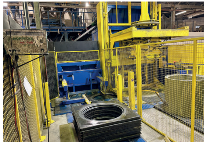
Automatic pallet infeed