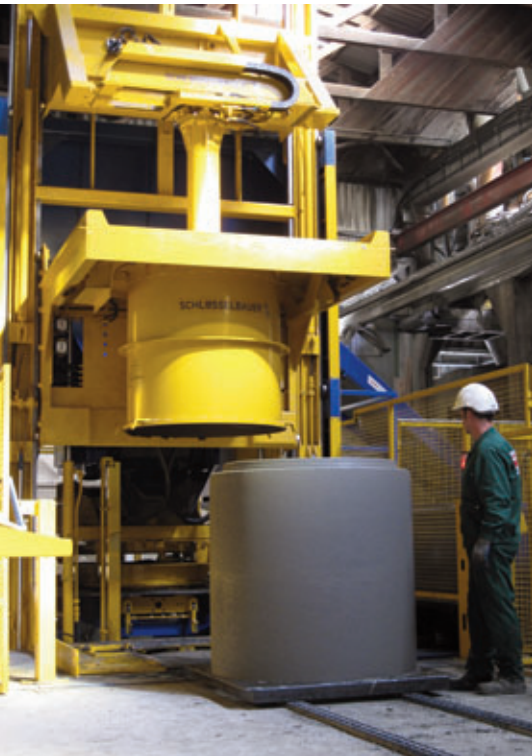
The MMagic is designed for product sizes up to Ø 820 externally in double production and up to Ø 1,800 mm externally in single production

an additional conveyor belt, a Skako bucket conveyor ensures the concrete is distributed in the Tiba production area.