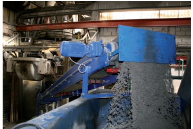
The Magic 1501 is supplied with concrete from the mixers of Frühwald's existing concrete production

the contract for a large infrastructure project in Kosovo this year, which is being funded in collaboration with the EU.