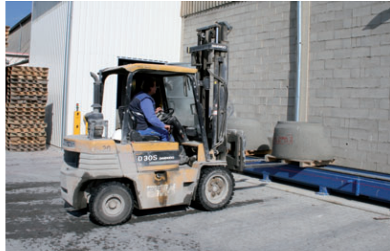
Forklifts are used to bring the concrete components to their temporary destinations in the external storage area