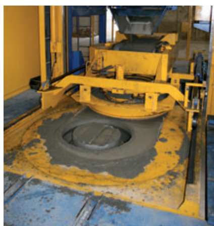
Filling and compression