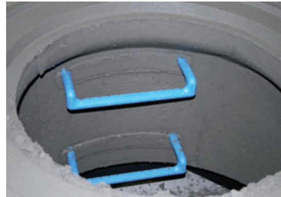
Fresh product with integrated step-rungs