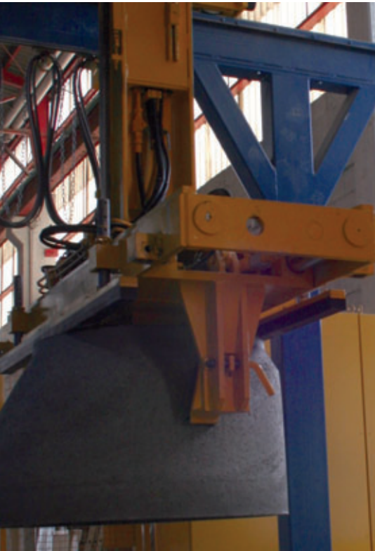
The crane uses a gripper to shift the manhole element

component securely on the walls and raises it slightly. In the following step, the pallet is released from the manhole part and the gripper raises the element to the conveyor belt into the external area. On this conveyor belt there are wooden pallets, continual supply is provided via the pallet store, located in the external area. This means there is always an empty pallet available onto which a manhole element is deposited by the gripper. The loaded pallet is then moved outwards via the conveyor belt. Here forklifts are used to move the concrete