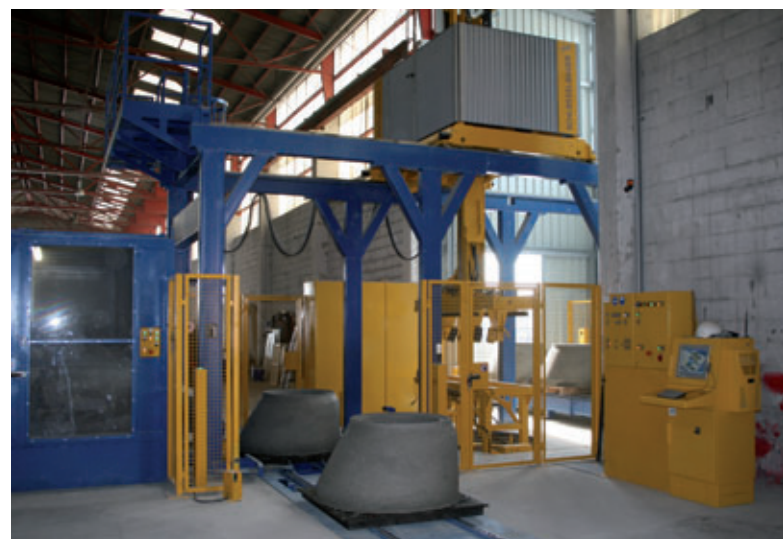
The hardened products from the previous day's production are moved to the loading station on the electric transport cart