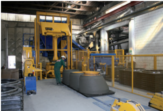
Magic 1501, to the right of the picture the pallet store in front of the oiling station