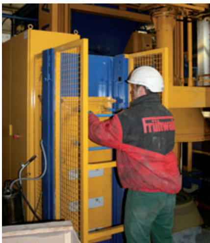
Inserting the steprungs into the Stepmaster

The Magic 1501 is supplied with concrete by the mixers of Frühwald's existing concrete production, with the concrete being moved via a conveyor belt from the mixing plant to the production plant. The storage container is quite spacious and is large enough for several cycles and the mixing plant can produce concrete for other Tiba or Frühwald production plants. Alongside