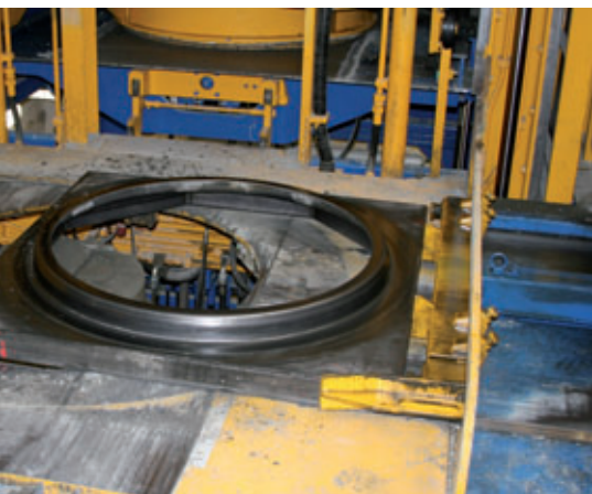
Automatic insertion of the pallets